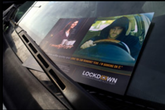
Distribute flyers to citizens and leave on cars to inform Coloradans of the dangers of leaving your car running unattended.